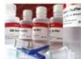
Genomic DNA Mini Kit (Blood/Cultured Cell)