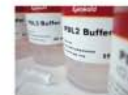
High-Speed Plasmid Mini Kit